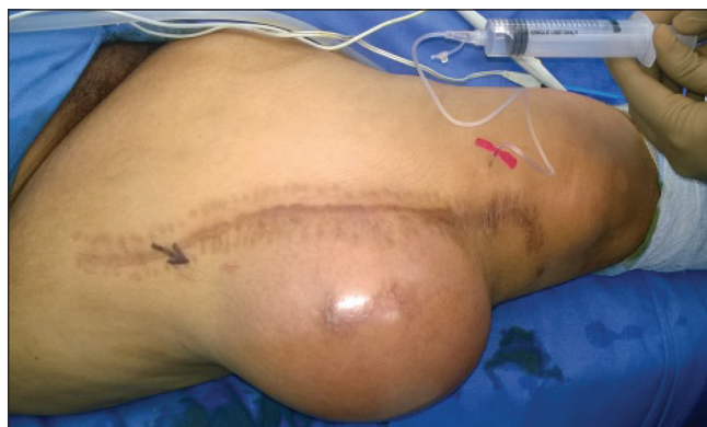
Figure 1: Tissue expander inflation

It can be used for instillation of dye (methylene blue) in a sinus/fistula to delineate the cavity/tract respectively as in a pilonidal sinus [Figure 5], presternal sinus. The hypodermic needle needs to be removed to avoid false tract formation.