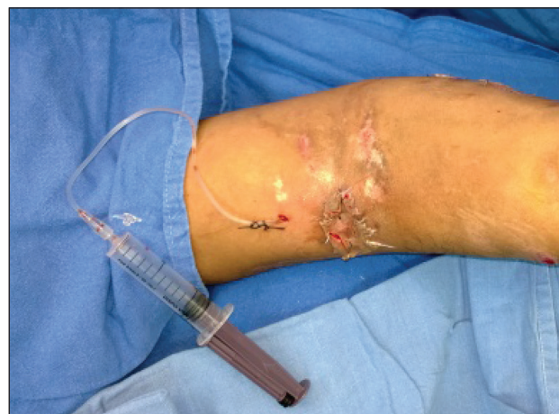
Figure 2: Continuous suction drain with 10 cc syringe and piston of 2 cc syringe