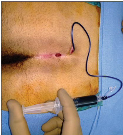
Figure 5: For instillation of dye in pilonidal sinus