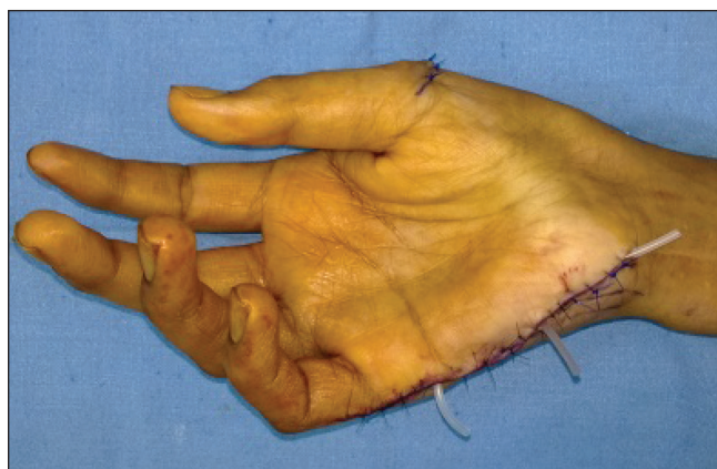
Figure 3: Penrose type tube drains post-Huber transfer of ADM (Abductor Digiti Minimi) for thumb Opposition

Scalp vein set can be used to cover the cut sharp end of K-wires during fracture fixation of digits [Figure 6].