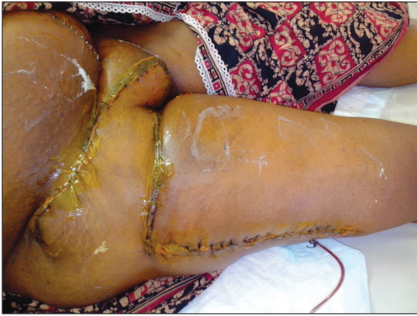
Figure 5: Post-operative day 12 following surgery

Our Flap dimensions ranged from 16 cm × 8 cm to 22 cm × 10 cm and all the donor defects were closed primarily. All the flaps did well without any complications [Figure 5].