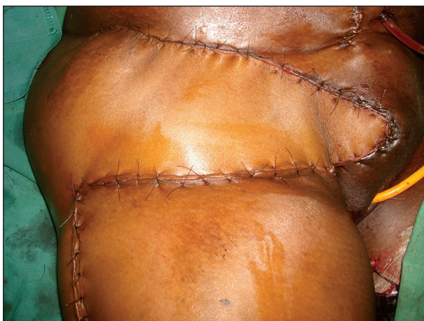
Figure 3: Immediate post-operative picture “V” flap