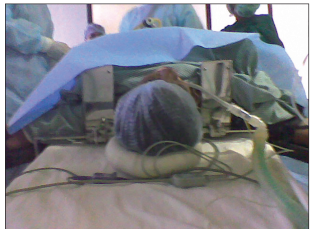
Figure 3: Shoulder blades in position over the plexus area

According to the WHO, an adjuvant pain medication should be considered at all stages of the pain ladder. [12]