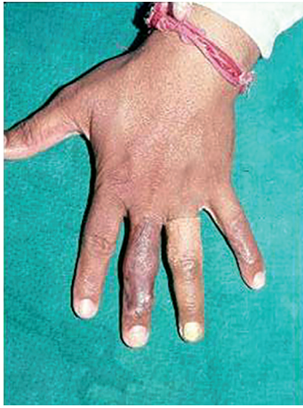
Figure 7: open hand with temporary prosthesis for dress occasions