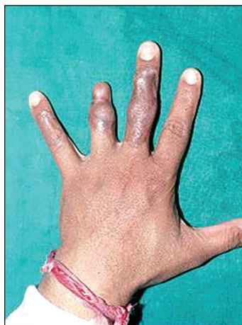
Figure 2: Post operative