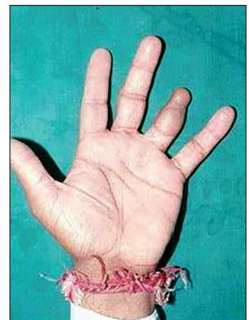
Figure 3: Post-operative