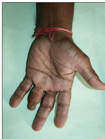
Figure 5: A 25 year follow-up - open hand