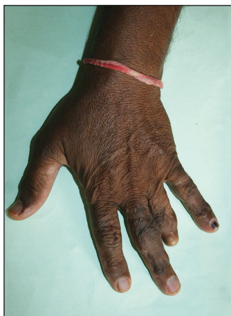
Figure 4: A 25 year follow-up