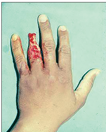
Figure 1: Ring avulsion injury

The cosmetic appearance of the finger was compromised because of the absence of the terminal phalanx. The grip was good demonstrating the value of saving the proximal inter phalangeal joint and a length of the middle phalanx. Although the author was trying to save a stump for accommodating prosthesis, the patient seemed to be more comfortable without one. This was one of the reasons that he did not come for follow-up.