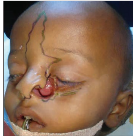
Figure 2a: Marking for the forehead-eyelid-nasal transposition flaps for correction of Tessier no. 3 facial cleft showing the two limbs over the forehead and inferior to medial brow

Tessier no. 2 clefts are located laterally to the midline Tessier No. 0 clefts without being paranasal. The cleft