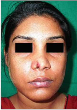
Figure 3f: Result at 5 months showing mild improvement in hyperpigmentation