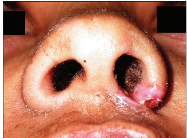
Figure 2b: A close up basal view of the nostrils at 15 th postoperative day. There is complete take of the graft but it is hypopigmented with a small area of epidermolysis still persisting

The nasal cavity is packed with paraffin gauze. The recipient site is smeared with an antibacterial ointment and left open for inspection. Immediately following surgery, and up to