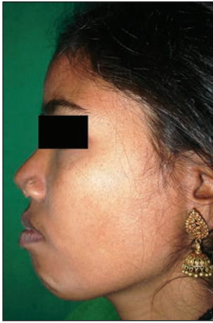
Figure 1b: Profile view showing loss of columellar projection