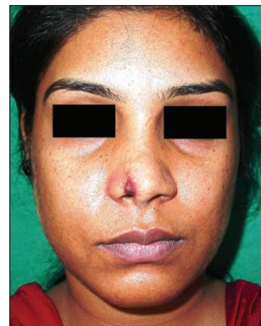
Figure 3e: Result at 3 months follow-up shows the graft has survived completely with some hyperpigmentation and graft shrinkage

using the 'glove finger' as the cooling tip on the graft. This is executed by the patient or his/her attendant with some help from nurses. No steroid creams or injections are ever prescribed. The follow-up has ranged from 3 to 10