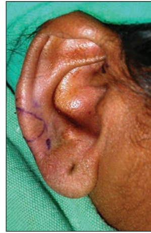
Figure 1c: An appropriate size composite graft was harvested from the lower helical margin and the donor defect closed primarily