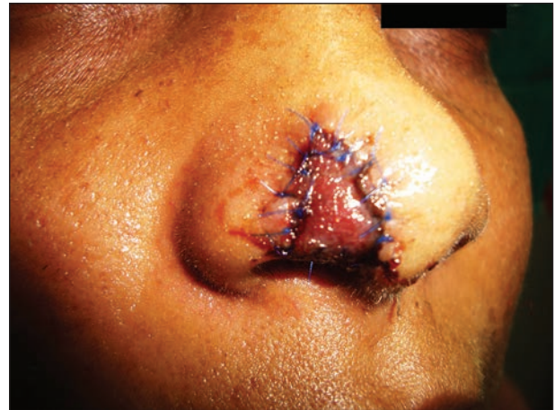
Figure 3c: Pinkish discoloration of the graft on 5 th postoperative day