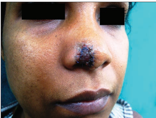
Figure 3d: Venous congestion of the graft on the 8 th postoperative day