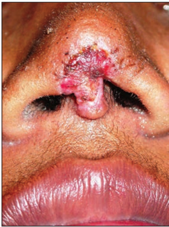
Figure 1d: A two-dimensional composite graft was placed on the defect. Result at 12 th postoperative day shows extensive epidermolysis