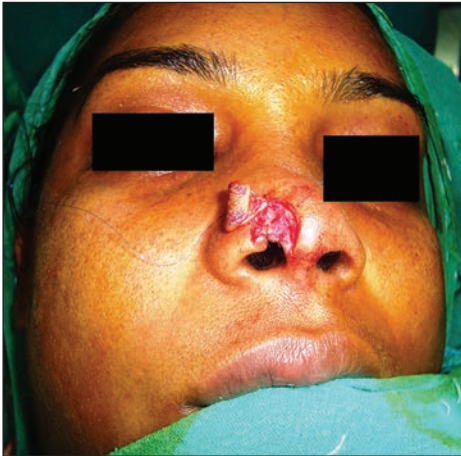
Figure 3b: A hinge flap was elevated from the recipient defect margin and the 'combination' graft was fixed into the defect