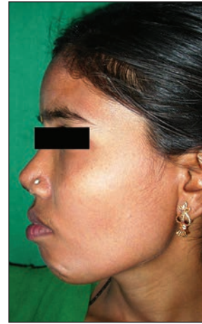
Figure 1e: Profile view of the patient at 6 months follow-up showing adequate restoration of columellar projection, albeit with hyperpigmentation