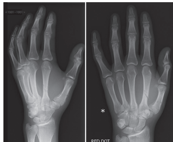
Figure 2: Radiograph demonstrating the adjacent second metacarpal fracture post removal of K-wires

K-wires crossing the fracture site can cause fragment distraction. K-wire convergence can create a pivot