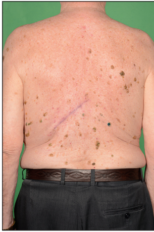
Figure 1: Photograph of back demonstrating relation of scar and seborrheic keratoses

As part of the sentinel lymph node biopsy, 4 ml of methylene blue dye was injected subdermally with a blue hypodermic needle over the centre of the scar to be excised. This was performed just after the patient had been anaesthetised and left to work for 15 min before the scar was excised. The scar was excised in the relaxed skin tension line, and primary wound closure achieved. At the time of surgery, there was no spill of the blue dye that may have caused the adjacent staining, and it was noted that the seborrheic keratosis adjacent to the wound was not blue. During 3 months follow-up in the outpatient clinic, it was noted that several bright blue lesions had appeared around the scar site. These were clinically diagnosed as seborrheic keratoses and this lesion had been present prior to the excision of the melanoma, hence, ruling out a satellite lesion. In his recent 6 months follow-up, the blue seborrheic keratosis mentioned was still present and had not changed.