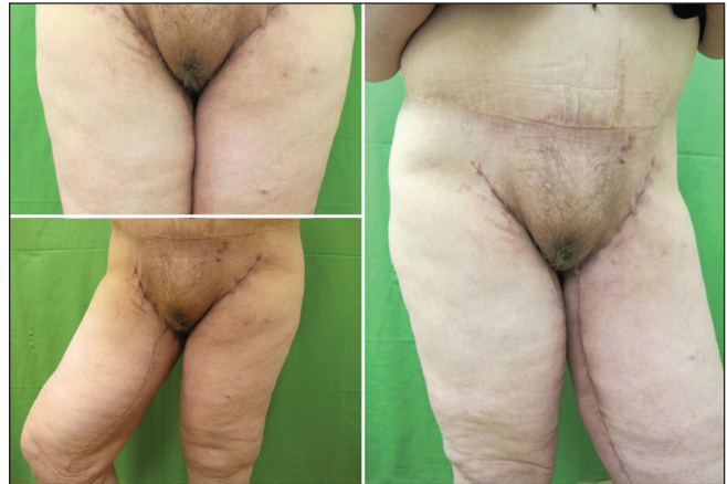
Figure 2: Photograph demonstrating early post-operative outcomes after our medial thigh lift

High BMI is associated with a greater incidence of complications, and our preference is to select patients with a BMI <30. In the 21 patients of the present study, 'junction' complications occurred only in active smokers. The seroma rate was 0%, comparing favourably to reported rate. [1] The outcomes of surgery are shown for two patients [Figures 2, 3 and 4]. The low-seroma rate in this technique is probably due to the reduced of dead space with a buried dermal flap and the combined