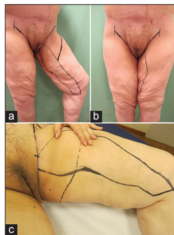
Figure 1: Photograph demonstrating the markings for our medial thigh lift. (a and b) Standing and (c) supine respectively

In the modified medial thigh lift procedure, pre-operative markings are made with the patient in both the upright and supine positions. The horizontal scar is planned at the inguinal crease, and the vertical scar runs along the medial aspect of the leg. The anterior part of the vertical scar is marked first, and then the posterior aspect is determined by pinching the skin. This marking scheme minimises the visibility of both scars [Figure 1a-c]. A single dose of a first-generation cephalosporin (e.g., cefazolin) is administered pre-operatively. During the surgery, the anaesthetised patient is positioned in a supine position, with a 90° angle between the thigh and the legs. Stockinettes are placed on the lower legs, which can then be moved freely. One surgeon sits between the legs; the assistant adopts a lateral position. The horizontal component in the inguinal crease region is corrected first, with particular attention to the superficial ventral inguinal area to avoid damage to lymphatic vessels and veins. Dissection is limited to the markings, to prevent dead space formation. The vertical excess skin is then marked, using temporary tailoring sutures along the pre-operative markings. De-epithelialisation of this excess is performed using a dermatome [Supplemental