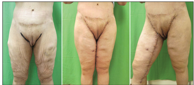
Figure 3: Another photograph demonstrating early post-operative outcomes after medial thigh lift. Note the superficial wound healing complication at the apex of the T