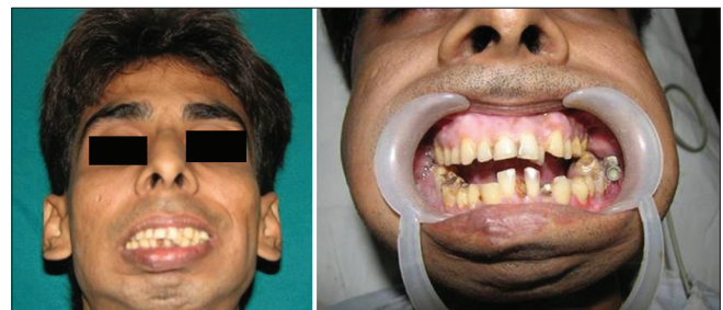
Figure 2: Malocclusion following mandibular distraction for retruded mandible in an operated case of temporomandibular joint ankylosis release

Considering the relative weights of the greater and the lesser fragments, there is a tendency for the smaller fragment to migrate superiorly rather than the distal fragment moving forward or downward as is desirable. This, apart from not achieving the purpose of distraction, can cause the fragment to impinge on the joint and curtail movement. This problem is shown in the lateral X-ray in this patient who had simultaneous double jaw distraction to correct the occlusal cant can't as well as deviation [Figure 3].