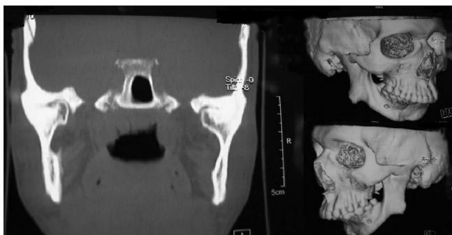
Figure 1: Coronal section and 3-D tomographic images of bilateral temporomandibular joint ankylosis demonstrating clearly the medio-lateral extent of the bony fusion

TMJ ankylosis surgery requires a sound knowledge of the distorted anatomy of the deformity. Damage to the frontal branch of the facial nerve may occur. In most cases it is due to retraction. By using the subfascial approach of Al Kayat and Bramley [1] it is possible to avoid using any sort of retraction till the deep fascia and periosteum is incised. This reduces the chance of traction on the nerve.