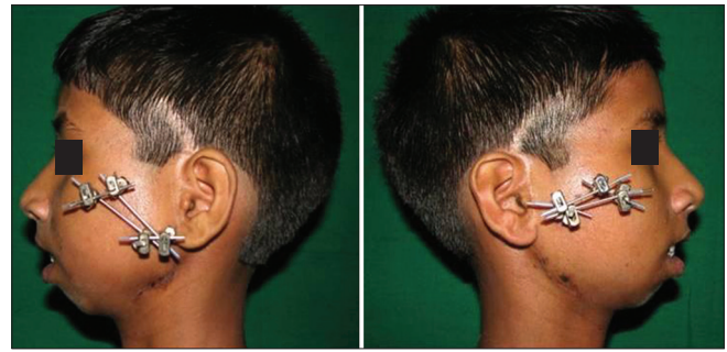
Figure 4: External fixator applied to prevent superior migration of proximal fragment (the distractor is intra-oral as seen in Figure 3)

Surgery for TMJ ankylosis is very rewarding but has a plethora of undesirable sequelae and complications. These patients have to be managed on a long term basis. Careful analysis, planning and execution of various surgical manoeuvres, anticipation of problems and their correction will go a long way in successful management of these issues.