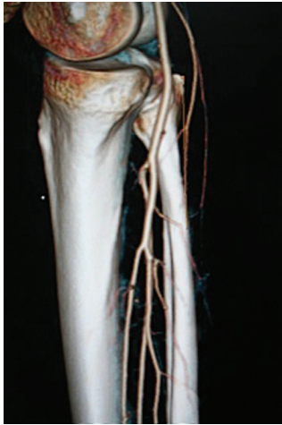
Figure 3: CT angiogram demonstrating the course and origin of the proximal peroneal perforator, arising from the common tibioperoneal trunk