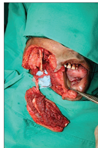
Figure 2: Inset of the flap into the defect demonstrating the flexibility in placing each component at the desired site