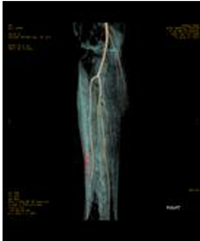
Figure 4: CT angiogram with subtraction of the bones to highlight the course and origin of the perforators

perforator anastomosis (<1 mm diameter), opening up the potential for such flaps. “Free-style free flaps,” a term coined by Wei and Mardini, [4] point to a flexible approach in planning after perforator identification. Though simplistic in concept, practically it is difficult to execute.