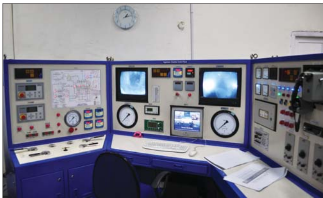
Figure 5: Control panel of the same hyperbaric chamber

The most common complication during HBOT is barotrauma (injury caused by pressure as a result of an inability to equalise pressure from an air-containing space and the surrounding environment) usually of the middle ear. For an unconscious patient, myringotomy may be done to prevent middle ear barotrauma. Other