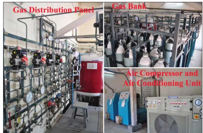
Figure 4: A combination photograph showing auxiliary units of a hyperbaric chamber