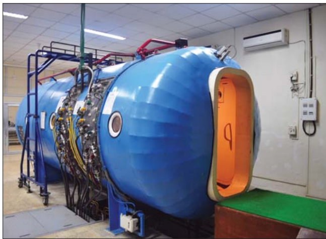
Figure 3: A multiplace hyperbaric chamber installed at INHS Asvini