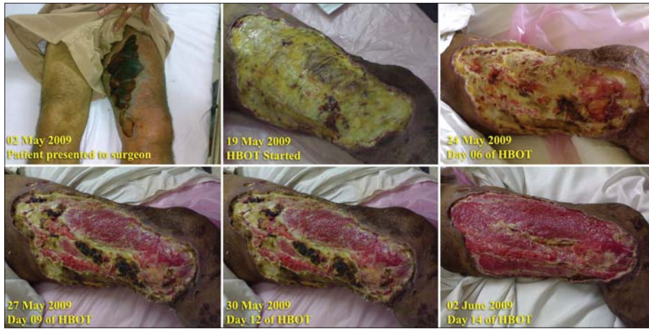
Figure 2: A combination picture showing sequential progress of spontaneous gangrene in a 53-year-old male diabetic managed with HBOT