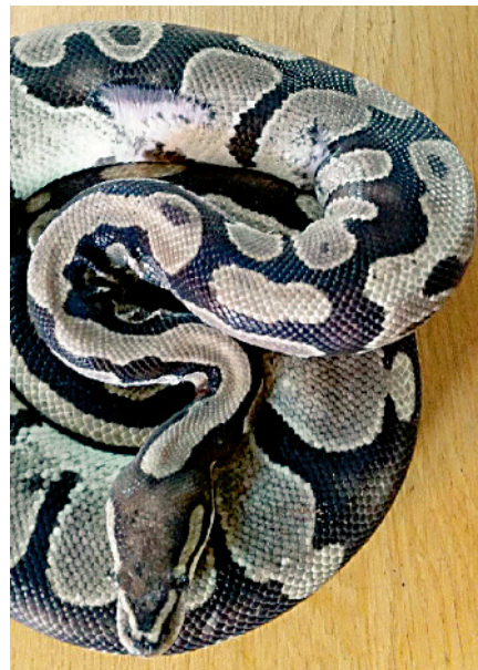
Fig. 3 Condition of the patient after 4 months. Despite scar tissue persisted on the former wounds, the snake has shown no symptoms of dysecdysis.

larly used to treat bacterial infections in snakes despite the limited pharmacokinetic data available (40). They are effective against most aerobic bacteria in reptiles, and distribute to all tissue including bone and inflammatory tissues (27). Adverse effects to fluoroquinolones are very uncommon in reptiles, though pain and in-