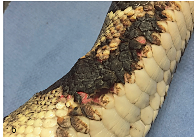
Abb. 1 Klinisches Bild des Königspythons. a) Scharf demarkiertes, nekrotisierendes Hautareal an der rechten Flanke im mittleren Körpersegment. b) Sich teilweise ablösender Brandschorf an der Brustwand mit Freilegung der darunterliegenden Muskulatur.

fective (16, 33) or does not penetrate the very thick, protective stratum corneum (19, 24). Many reptilian species rapidly develop adverse reactions with some antibiotics such as nephrotoxicity (26). Euthanasia sometimes has to be considered a reasonable option as ultima ratio.