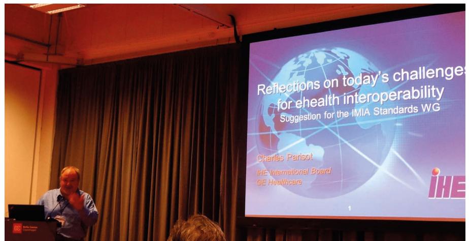
Fig. 6 Charles Parisot presenting reflections on today's challenges for ehealth interoperability