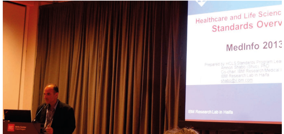
Fig. 4 Amnon Shabo presenting about HL7 activities