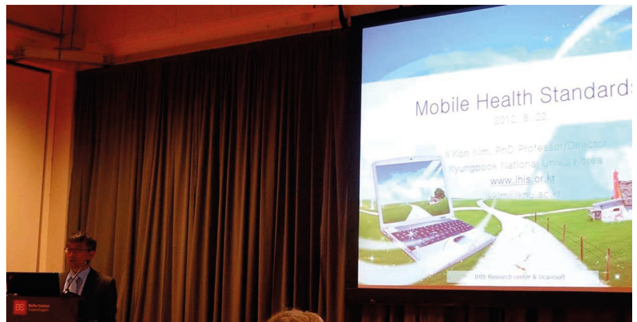
Fig. 5 Il Kon Kim presenting about the mobile health standards