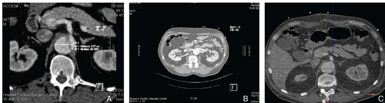
Figure 2. CT angiography showing evolution during the follow-up period. Panel A . Preoperatively. Panel B . Four days after the operation. Panel C . Two years after the operation.