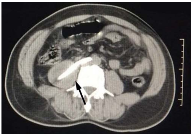
Figure 2. Computerized tomogram showing the tip of the pigtail catheter traversing the inferior vena cava and right common iliac artery.

approach, the IVC was plicated at its confluence with the iliac vein. Hemostasis was achieved. Drains were placed in the psoas abscess cavity and peritoneum. The abdominal cavity was closed. The patient was managed with inotropic support and transfusion of blood and blood products in the perioperative period. He was administered unfractionated heparin considering the high probability of DVT.