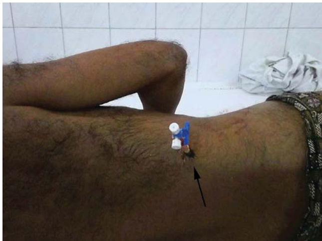
Figure 1. The entire length of the pigtail catheter passed through the right flank (arrow).