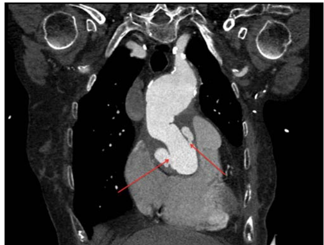
Figure 4. Computed tomography angiography of the chest showing the anterior and posterior extensions (arrows) of false aneurysm of the ascending aorta after its prosthetic replacement.

Major challenges of surgical therapy for these complex cases are choosing an approach that allows for safe reentry into the chest and efficient cerebral protection. The critical risk is FA rupture, which may lead to catastrophic hemorrhage during sternotomy. This risk is greater if the FA is situated retrosternally with an aorto-cutaneous fistula. Selective cerebral perfusion through the carotid arteries is the method of choice in our institution, and its efficacy for cerebral protection has been demonstrated [6–8]. This technique allows for mediastinal dissection and control of the distal aorta