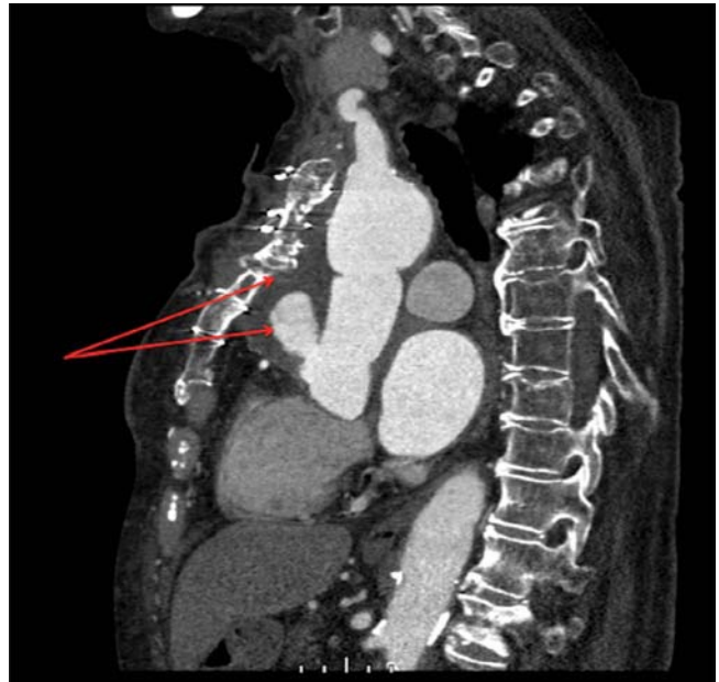
Figure 2. Computed tomography angiography of the chest showing the aorto-cutaneous fistula. Note the false aneurysm containing contrast and surrounding hematoma between the prosthetic ascending aorta, back of the sternum, and skin (arrows).

cleidomastoid cervical incisions by cardiopulmonary bypass (CPB) and cerebral protection for instituting hypothermic partial circulatory arrest before reentry into the chest. Cerebral protection was monitored with near-infrared spectroscopy. CPB and cooling were instituted before skin incision and stopped when the FA rupture occurred during the sternotomy. Cerebral protection was achieved by cooling the patient to 24°C, occluding the proximal left carotid and brachiocephalic arteries, and reducing bypass flow transiently to 800 mL/min. Mediastinal dissection and distal anastomosis between the hemi-arch and Dacron graft (Gelweave Vasculatex Terumo, 32 mm) for hemi-arch replacement were performed under partial hypothermic circulatory arrest. The total duration of partial hypothermic circulatory arrest was 41 min. The distal Dacron graft was then cross-clamped, and normothermic full flow cardiopul-