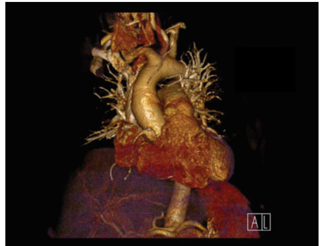
Figure 3. Postoperative computed tomography image obtained 10 years after surgery showing the ascending aorta and right coronary artery.