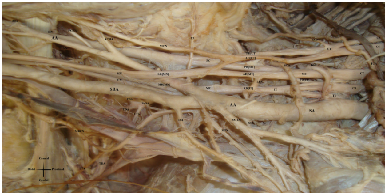
Figure 2 Cadaveric photo of variation of brachial plexus and axillary artery variations. UT: Upper trunk; MT: Medial Trunk; IT: Inferior Trunk; AD [UT]: Anterior division of Upper Trunk; AD [MT]: Anterior division of Middle Trunk; AD [IT]: Anterior division of Inferior Trunk; PD [UT]: Posterior division of Upper Trunk; PD [MT]: Posterior division of Middle Trunk; PD [C8]: Posterior division of C8; MC: Medial Cord; PC: Posterior cord; MR [MN]: Middle root of median nerve; LR [MN]: Lateral root of median nerve; MCN: Musculocutaneous Nerve; MN: Median Nerve; UN: Ulnar Nerve; RN: Radial Nerve; AN: Axillary Nerve; SCN: Suprascapular Nerve; MBCN: Medial Brachial Cutaneous Nerve; LPN: Lateral pectoral nerve; MPN: Medial Pectoral Nerve; SA: Subclavian Artery; SCA: Suprascapular Artery; DSC: Deep Scapular Artery; AA: Axillary Artery; SBA: Superficial Brachial Artery; dBA: Deep Brachial Artery; DSC: Deep Scapular Artery; TCA: Transverse Cervical Artery; STA: Superior Thoracic Artery; TA: Thoracoacromial Artery; PA [TA] Pectoral Branch of Thoracoacromial Artery; SuSA: Subscapular Artery; LTA: Lateral Thoracic Artery; TDA: Thoracodorsal Artery; CSA: Circumflex Scapular Artery; IPA: Inferior Pectoral Artery; ACHA: Anterior Circumflex Humeral Artery; PCHA: Posterior Circumflex Humeral Artery.