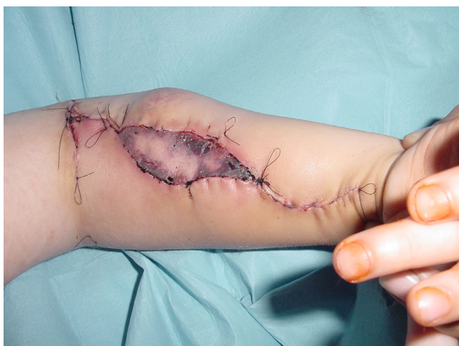
Figure 5 Intraoperative situation – closure.

The decision for the free muscle transfer was taken after one nerve biopsy in all children but one, where a second biopsy was mandatory six months later to show a sufficient reinnervation pattern. The first child had previously a SAN to ulnar nerve neurotisation at the proximal forearm level using a saphenous graft. In this case, the biopsy and the later nerve coaptation were made directly on the distal graft which was separated from the ulnar nerve.