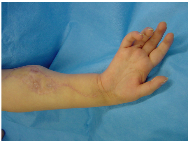
Figure 1 Preoperative flail hand.