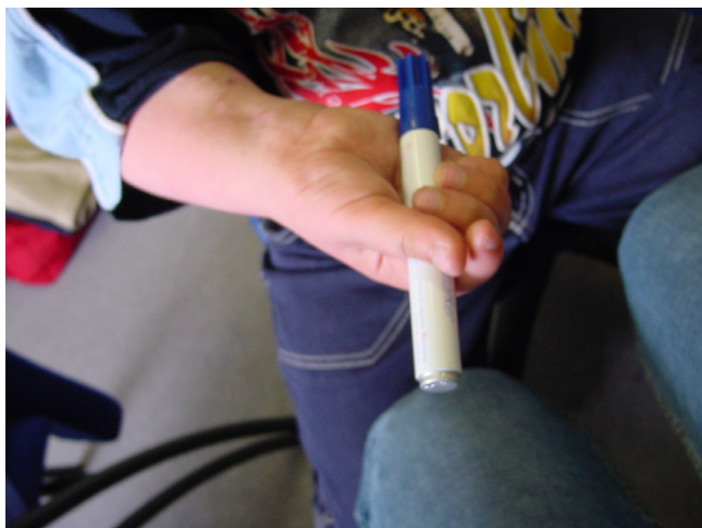
Figure 6 Postoperative function.

A good motor nerve connected with the shortest distance to a healthy and strong muscle which is adapted to the functional demand may result in a successfully reanimated major limb function. The reinnervation quality of the donor nerve could be followed by a progressing Hoffmann-Tinel sign along the anterior arm, but a qualitative assessment is only possible through histopathologic studies. The possibility of quantitative assessment of motor fiber content in the donor nerve is still under discussion [11].