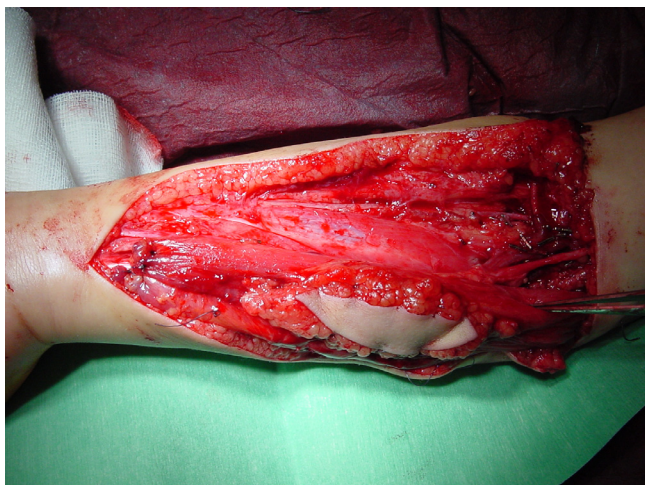
Figure 4 Intraoperative situation – muscle sutured in the forearm.

Every patient underwent 4 weeks postoperatively an angi-MRI to check good vascular supply into the transposed muscle and an elective EMG at about 6 months.