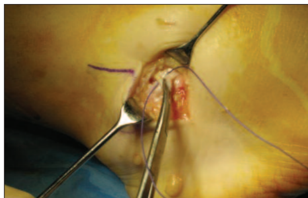
Fig. 1. The capsule and the remnant of the anterior talofibular ligament are isolated, sectioned and sutured.