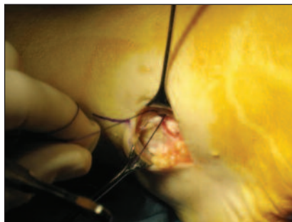
Fig. 2. The capsule and the remnant of the anterior talofibular ligament are sutured (using mattress sutures) to the fibular periosteum.