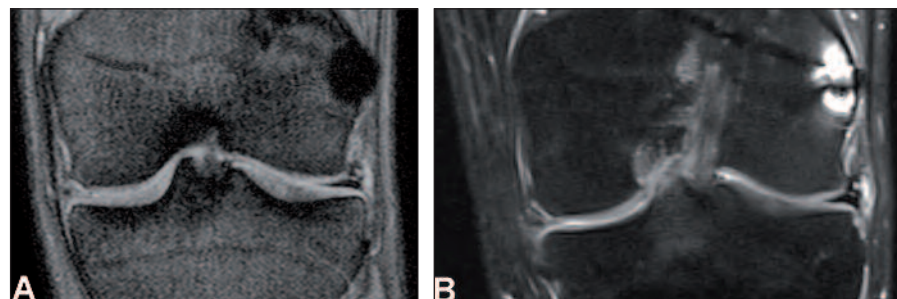
Fig. 2. MR features of the meniscal implant at 12 months (A) and 24 months (B). The implant signal, remaining hyperintense compared with that of normal meniscus, confirms its presence.

On MR evaluation, implants were always stable, properly located, and comparable in size to the native meniscus, albeit the signal was always hyperin-