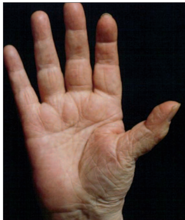
Fig. 3. Deformity typical of advanced TMJ OA.

In the presence of stage IV disease, possible procedures include arthrodesis, trapeziectomy, trapeziectomy with LRTI, interpositional arthroplasties and TM and STT joint replacements (all of which we have already dealt with). There are no significant differences between them.