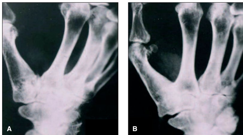
Fig. 1. Radiological follow-up of arthrodesis at two years (A) and five years (B) after surgery.

literature contains several classifications based primarily on evolving radiographic changes. The most widely adopted is that of Dell et al. (10), which divides rhizarthrosis into four stages of evolution, in relation to which the therapy is decided. In stage 1, the treatment used is mainly conservative and symptomatic, involving the use of night splints, rest, orthoses, non-steroidal anti-inflammatory drugs (NSAIDs) and infiltration of corticosteroids. In stage 2, especially in young people and in people involved in heavy manual work, and in stages 3 and 4, arthrodesis was, until 1992, the most widely used treatment; since then most authors have preferred the tendon suspension arthroplasty technique. Finally, in the presence of pan-carpal OA, some authors recently recommended arthroplasty associated with selective denervation of the wrist (11, 12).