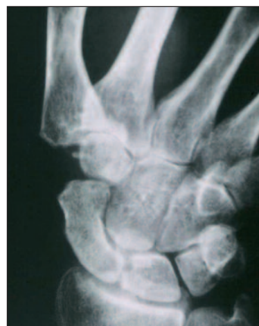
Fig. 2. Radiological long-term follow-up of suspension arthroplasty according to Weilby and Ceruso et al.

The literature contains several reports on the use of TMJ arthrodesis (49-53). The most widely used technique is the traditional one described by Muller in 1949 (54), which is performed under regional anesthesia and limb ischemia. Cavallazzi et al. (55) carried out a 10-year follow-up of 42 patients (a total of 43 hands) submitted to arthrodesis of the TMJ for dege-