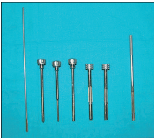
Fig. 1. Surgical instruments originally designed for autologous chondrocyte implantation and then adapted for bone marrow-derived cell transplantation.

detached cartilage fragment and subchondral malacic bone until the healthy bone was reached. With the help of a calibrated probe, we measured the lesion size. Then, the composites to be implanted were prepared. When collagen was used, 1g powder was mixed with 2 ml bone marrow concentrate and 1 ml platelet-rich fibrin gel to create a malleable paste rich in bone marrow progenitor cells and growth factors. Instead, the hyaluronic acid membrane was cut to an appropriate size following the area of the lesion and loaded by capillary action with 2 ml bone marrow concentrate and 1 ml platelet-rich fibrin gel. The composites were placed using the same instrumentation described elsewhere for arthroscopic autologous chondrocyte implantation (CITIEFFE Srl, Calderara di Reno, Italy) (11) (Fig. 1). The cannula was inserted through the arthroscopic portal closest to the lesion with the help of the dedicated trochar, the distension liquid flow was stopped, and the liquid was removed from the articular environment. The final composite was run through the cannula onto a sliding positioner up to the margin of the lesion, where it was positioned with the help of a probe. We then removed the cannula and carefully fitted the composite into the lesion site using a flattened probe (Fig. 2). A layer of platelet-rich fibrin gel then was spread on the implant to provide an additional supply of growth factors and to optimize its stability