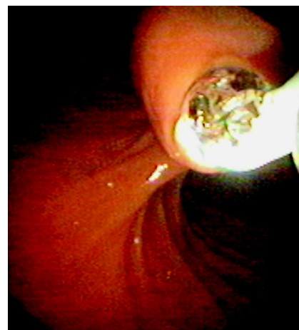
Fig. 2 After an incision on the cyst, balloon dilation through the guide wire was performed. Thereafter, a pigtail stent was implanted.

An incision was made with a needle-knife sphincterotome (Boston Scientific Microvasive, Indiana, USA) on the anterior portion of the cyst. After the cyst was cannulated, a guide wire was sent into the cystic cavity. Thereafter, dilation with an 8-mm diameter balloon (● Fig. 2) and a consecutive plastic stent implantation (10-Fr double-pigtail) were performed. Drainage of a whitish viscous secretion, but not the bile, was observed through the pigtail stent. The pigtail stent was endoscopically removed 1 month later, and the DDC cavity was found to be totally collapsed (● Fig. 3). Four months after