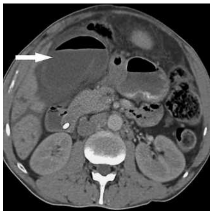
Fig. 1 Computed tomographic image showing a dilated gallbladder (arrow) with an air-fluid level.