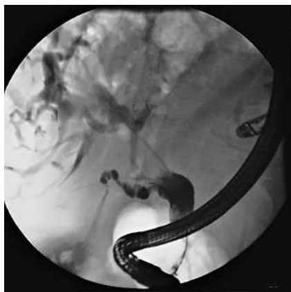
Fig. 2 Cholangiography demonstrated partial cystic duct obstruction and a markedly dilated distal common bile duct due to thrombus. The right-sided intrahepatic biliary tree is also dilated.