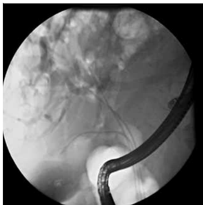
Fig. 4 The proximal end of the biliary wing stent can be seen here to be within the gallbladder lumen. Two additional wing stents were placed in branches of the right hepatic duct.

A 43-year-old man with Caroli's disease underwent a transjugular intrahepatic portosystemic shunt procedure, after which he developed marked hemobilia that was believed to be secondary to hepatic artery injury. He then developed acute cholangitis as a result of the increased pressure on the bile ducts from obstructing blood clots. Four separate endoscopic retrograde cholangiopancreatograms were performed to clear thrombus from his bile ducts and relieve the obstruction with conventional stent placement, but after dislodgment of the clots