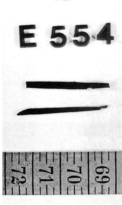
Figure 2: The extracted foreign bodies.