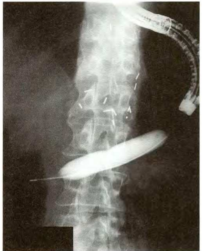
Figure 1: Gastric stricture causing "waisting" of a 20 mm Microvasive TTS hydrostatic balloon during dilatation.

W. Dickey M.D. Department of Medicine Institute of Clinical Science Grosvenor Road Belfast BT12 6BJ United Kingdom