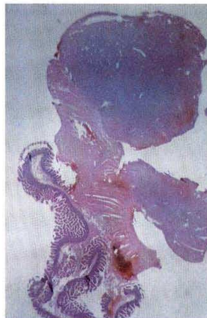
Figure 3: Histological section of the resection specimen, demonstrating a submucosal malignant schwannoma of the duodenum.