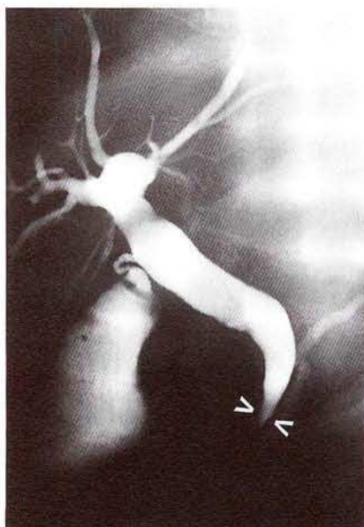
Figure 1: ERCP demonstrates a smooth prepapillary stenosis (arrows) of the common bile duct, with dilation of the extrahepatic bile ducts.