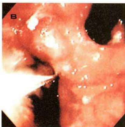
Figure 2: Cardiac varices with a shallow ulcer one week after 50% glucose sclerotherapy.