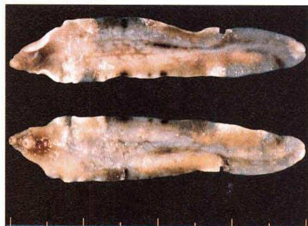
Figure 2: Extracted adult Fasciola gigantica , with still visible impressions from the Dormia basket.

H. Schwacha 1 , M. Keuchel 1 , G. Gagesch 2 , F. Hagenmüller 1