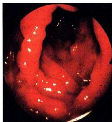
Figure 2: Giant mucosal folds in the colon.

nodes and in a transperineal biopsy of prostatic tissue (disseminated form of low-grade B-cell lymphoma, stage MALT-IV E).