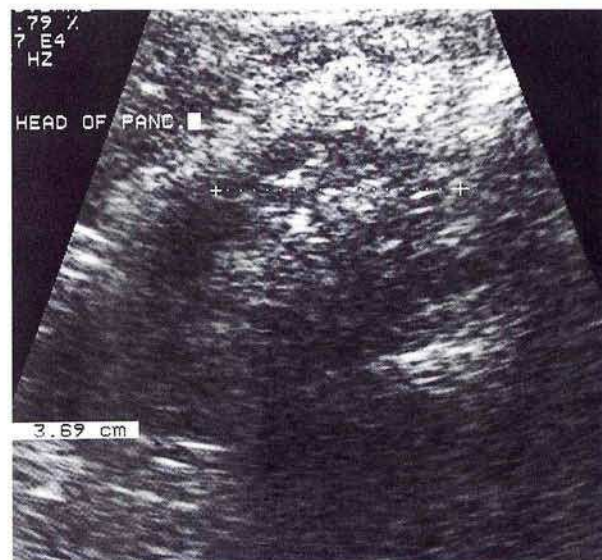
Figure 2: An apparent mass in the region of the head of the pancreas.