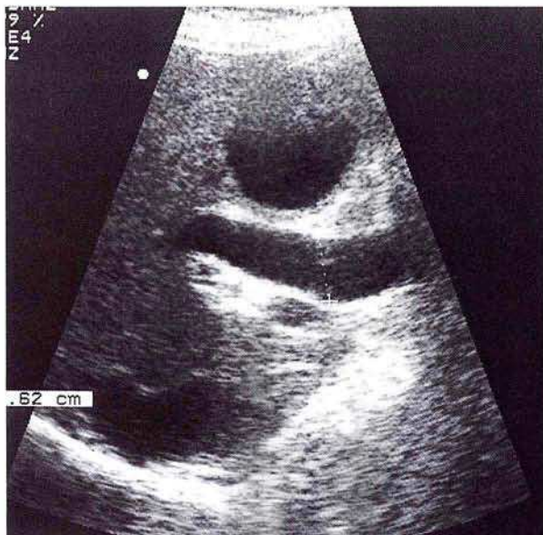
Figure 1: Dilation of the common bile duct.

A 64-year-old woman presented with jaundice and upper abdominal pain. Serum bilirubin was 52 \mu\text{mol/l} , alkaline phosphatase 2413 U/l, aspartate transaminase 330 U/l, and alanine transaminase 392 U/l. The ultrasound examination revealed dilation of the common bile duct, of the intrahepatic ducts, and of a stone-free gallbladder (Figure 1). There was also an apparent mass in the region of the head of the pancreas (Figure 2). Attempted endoscopic retrograde cholangiopancreatography showed that the papilla was hidden in a large diverticulum that was packed with vegetable matter (Figure 3). Using a balloon catheter and tripod forceps, the diverticulum was cleared completely of debris, and this was followed by a gush of bile from a papilla that was still not visible. Due to concern about introducing infection into the biliary system or pancreas, no attempt was made to cannulate. After the procedure, the patient's liver biochemistry returned completely to