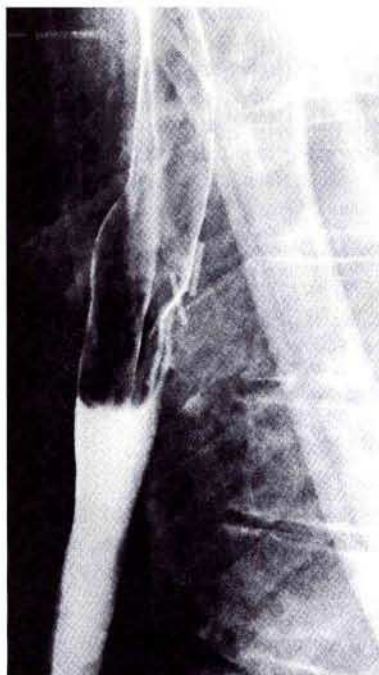
Figure 2: The barium study six months after the operation. No stenosis can be seen in the operated area (metal clips).