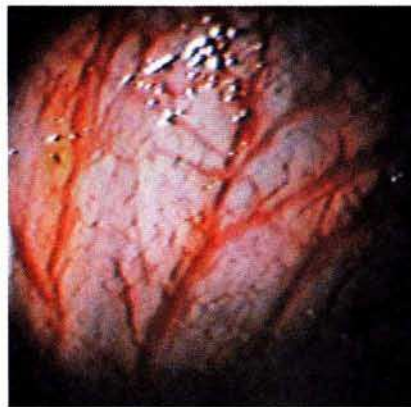
Figure 1: Colonoscopic appearance – dilated tortuous abnormal vessels in sigmoid colon.