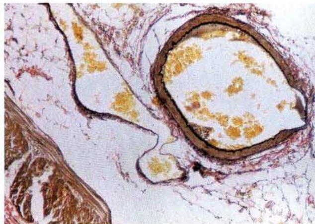
Figure 3: Histological appearance of vascular lesion: Van Gieson stain revealed both arterial and venous structures in the lesion.

rhagic telangiectasia) usually involve the entire gastrointestinal tract, with oral mucosal lesions and a positive family history. Type 4 lesions are acquired angiodysplasias seen with systemic disorders. Whereas angiodysplasias are predominantly submucosal venous channels which never infiltrate the muscular or serosal layers, telangiectasia can involve the full thickness of the bowel wall but never have an arterial component (3). Our patient had type 2