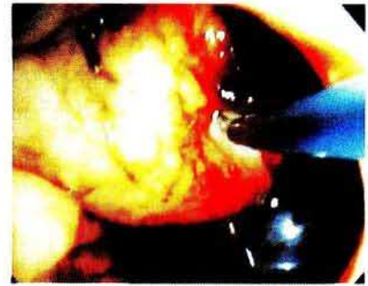
Figure 2: Decompression of the abscess using a three-pronged retrieval device to enlarge the opening.