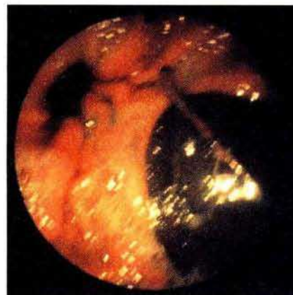
Figure 1: The bay leaf under the pylorus.

Dept. of Gastroenterology and Endoscopy, Maribor Teaching Hospital, Ljubljanska, Maribor, Slovenia