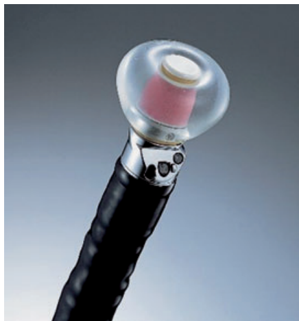
Fig. 1 Radial electronic echoendoscope.

In the electronic instruments the image orientation and staging can be assisted by the addition of pulsed, color and power Doppler.