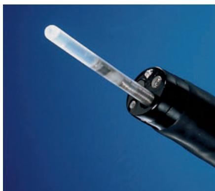
Fig. 2 High frequency transducer through working channel of an endoscope.

EUS-FNA. Once a suspicious lymph node or liver lesion is identified on EUS, EUS-FNA can be performed in order to confirm the presence of metastasis. EUS-FNA is performed with a linear echoendoscope. Doppler ultrasound can be used to ensure that there are no interposed vessels. The FNA needle system, consisting of a 19, 22- or 25-gauge needle, is inserted through the working channel of the endoscope and advanced through the gut wall into the suspicious lesion under endosonographic guidance