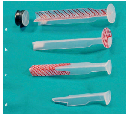
Figure 1 a Preparation of the vacuum syringe. The piston was removed from a 20-ml plastic syringe, and the distal knob was cut off. a,b A pair of adjacent flanges of the remainder of the piston were then removed along its entire length. b,c Three-quarters of the proximal circular part was then cut off, so that the remaining quarter corresponded to the angle formed between the remaining two flanges. c,d The shaded area of the remaining flanges was cut off to fashion the final version of the device.

The use of the device is as simple as its preparation. Firstly, take another plastic syringe of the same capacity as was used