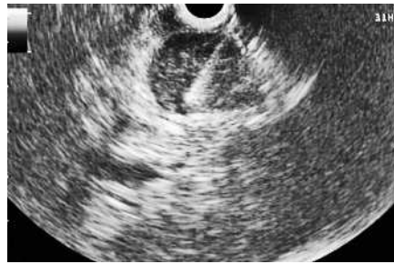
Figure 1 Endoscopic ultrasound image of the gastric stromal tumor, showing the Trucut needle after firing of the cutting sheath.

Until now, only one case of immediate bleeding after EUS-TNB of a gastrointestinal stromal tumor has been reported and in that patient hemostasis was achieved