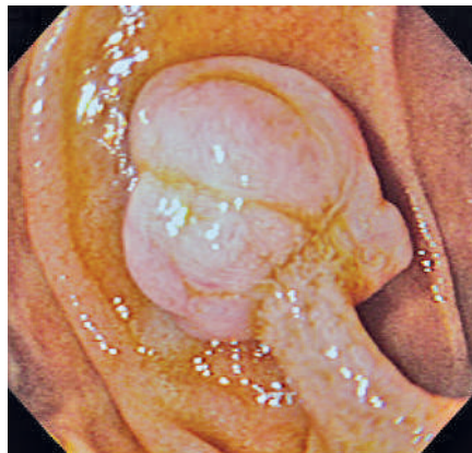
Figure 2 Upper gastrointestinal endoscopy in patient 2 revealed a pedunculated and lobulated polyp in the second portion of the duodenum.

tic of a Peutz–Jeghers polyp. The possibility of a solitary Peutz–Jeghers-type hamartoma should be considered in the differential diagnosis of a duodenal polyp.