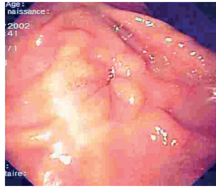
Figure 1 Endoscopic view showing the gastric side of the gastrocutaneous fistula.

Refractory gastrocutaneous fistula is a rare complication of PEG insertion [1]. A nonhealing gastrocutaneous fistula usually requires surgical closure of the fis-