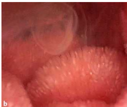
Figure 1 A 21-year-old woman, with a 14-month history of recurrent diarrhea, steatorrhea, hypoproteinemia and peripheral oedema, underwent upper gastrointestinal endoscopy. A Fuji EG-485ZH video endoscope was used, which is capable of providing high-resolution images (because of its 850 000-pixel chip) and up to 2× magnification. In the second part of the duodenum the mucosal surface had an appearance resembling rice grains ( a ), and diffuse fluid, which was producing a smoke-like mist, was observed ( b ).