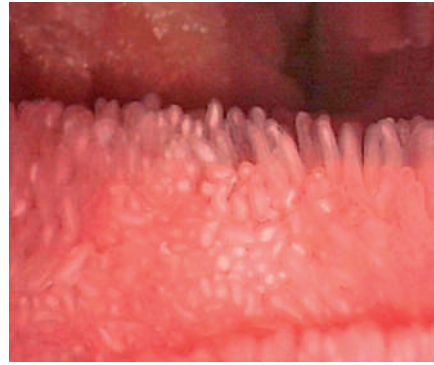
Figure 2 Under magnification, the finger-like processes were seen to resemble small white lights. A final diagnosis of primary intestinal lymphangiectasia was made. With the new-generation video endoscope used in this case we were able to obtain images never seen before, images showing dilated capillary vessels in intestinal villi and the loss of lymph fluid into the gastrointestinal tract.

G. Cammarota, R. Cianci, G. Gasbarrini Department of Internal Medicine and Gastroenterology, Catholic University of Rome, Italy