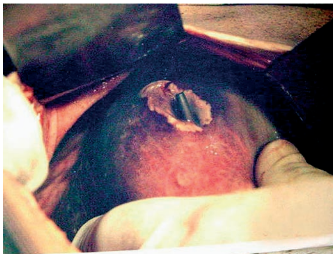
Figure 2 Peroperative photograph showing the hepatic perforation in the anterosuperior part of the right lobe of the liver caused by the migrated stent.

Kral-Sangri Brain, Nishat Srinagar Kashmir India Fax: +91-194-2403470 E-mail: omarjshah@yahoo.com