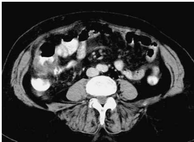
Figure 1 Colonoscopy must be avoided whenever colonic diverticulitis is suspected. However, some patients are diagnosed endoscopically, most of them with left-sided diverticulitis. A 74 year-old woman presented with lower right abdominal pain. Her physical examination did not show any evidence of an abdominal mass or any peritoneal signs. Complementary studies showed a neutrophil count of 10 950/ml and cecal wall thickening, with distortion of the surrounding fatty tissue on abdominal computed tomography, suggesting a colonic tumor.