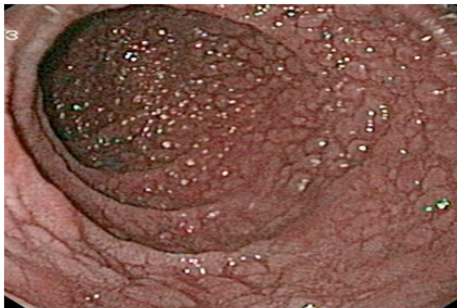
Figure 1 A 24-year-old man presented with chronic diarrhea. Mild splenomegaly was observed during the physical examination. Upper gastrointestinal endoscopy revealed numerous polypoid lesions in the duodenum.