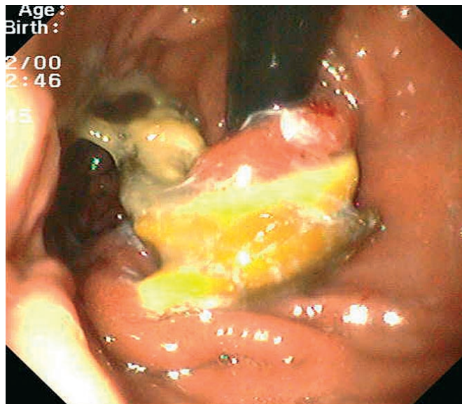
Figure 1 A 48-year-old woman had undergone gastric banding for extreme obesity (body mass index of 47) 3 years earlier. She subsequently complained of diffuse, persistent upper abdominal pain. Upper endoscopy revealed gastritis. No amelioration occurred under treatment with proton pump inhibitor (PPI). Control endoscopy eventually showed intragastric migration of the white gastric band.

Universitätsklinikum Charité, Med. Klinik m.S. Gastroenterologie, Hepatology und Endokrinologie Schumannstr. 20/21 10707 Berlin Germany Fax: +49-30-450514939 E-mail: ocran@charite.de