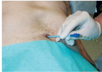
Figure 1 A standard endoscopic retrograde cholangiopancreatography (ERCP) guide wire (0.35-inch Jag-wire; Boston Scientific, Miami, USA) is passed through the fistulous tract until well into the stomach. Vascular dilators (Kimal, Uxbridge, England) are then passed over the guide wire to sequentially dilate the tract to 2 Fr larger than the replacement tube, or until sufficient resistance or discomfort prevents further enlargement. The guide wire usually passes very easily into the stomach, but if resistance is met, withdrawal and further gentle probing usually locates the tract. Minor bleeding can occur which is self-limiting.

The Seldinger technique of PEG replacement was first reported in four cases of surgically created gastrostomies [2] but has not become widely accepted. Transcutaneous PEG replacement has also been described using Savary-Gilliard dilators (three cases) and Hegar’s dilators (eight cases) [3,4]. This blind approach to dilation carries the potential risk of creating a false passage. The Seldinger technique has the advantage of preventing this by using the guide wire. This gives the replacement PEG more stiffness and makes replacement easy and atraumatic. Transcutaneous PEG replacement should be used with great care in patients with gastrostomies less than 4 weeks old. Fluoroscopy can confirm correct positioning of the wire under these circumstances.