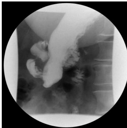
Figure 3 Gastrografin meal, showing no leakage of dye into the peritoneal cavity and confirming complete closure of the duodenal tear.

the context of the patient's coexistent malignant disease. The present report, along with others, suggests that endoscopic clipping is a useful technique for closure of iatrogenic upper gastrointestinal perforations.