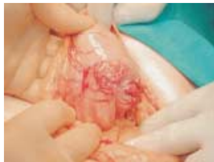
Figure 2 The posterior wall of stomach at laparotomy, showing a multilobed, irregular lesion (3.6 cm in diameter), with large feeding vessels.