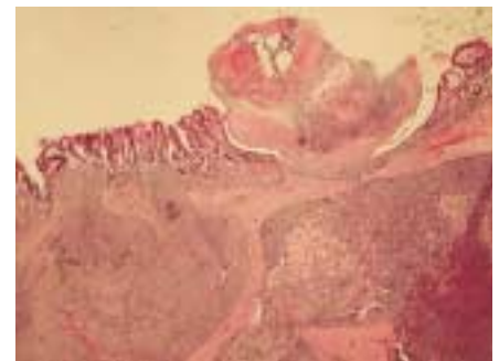
Figure 3 The lobulated tumour within the submucosa, consisting of bland cells with abundant cytoplasm (haematoxylin-eosin stain; original magnification \times 20 ). There was marked intravascular invasion, with the tumour extending to the resection margin.